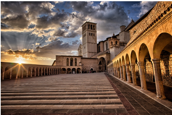
ST. FRANCIS OF ASSISI