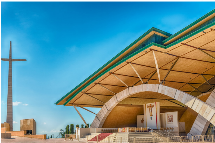
SAN GIOVANNI ROTONDO