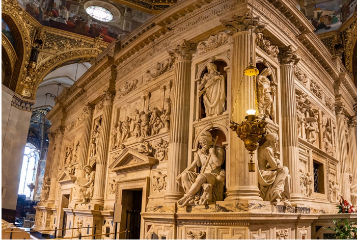
HOLY HOUSE OF LORETO